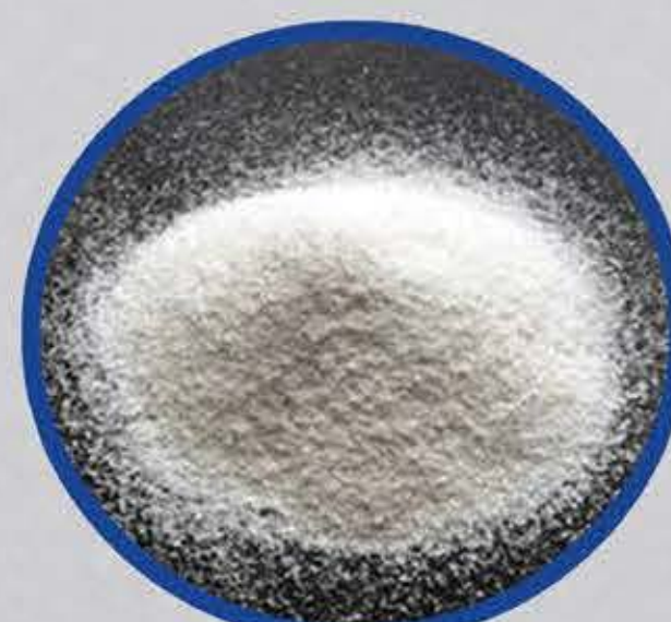
Soda Ash (Light & Dense)