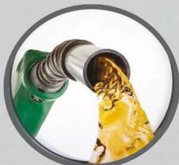
Diesel 5 PPM