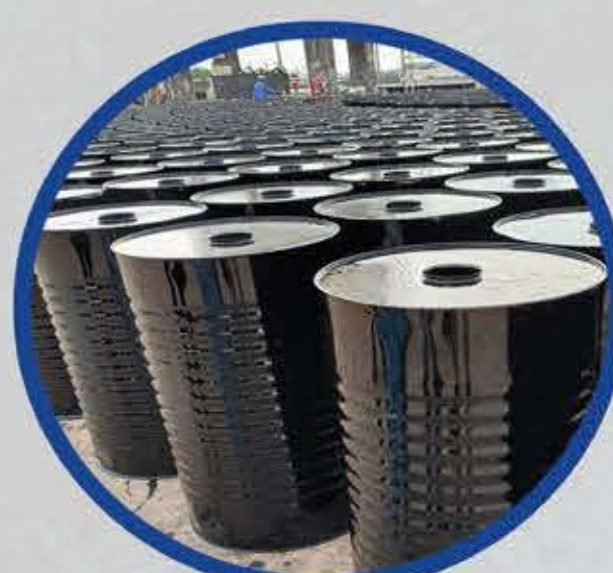
Bitumen (All grades)