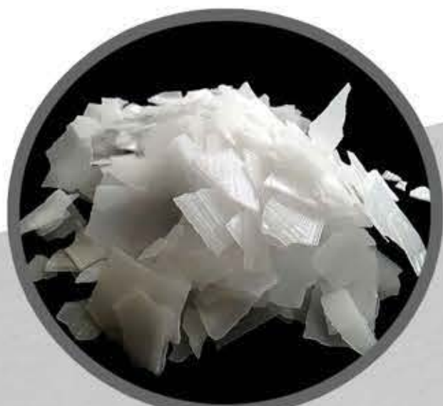
Caustic Soda (Flakes, Liquid)