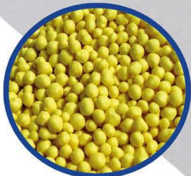
Sulphur (Lump & Granular)