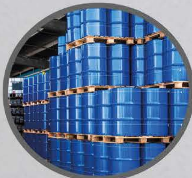
Glycol (MEG, DEG, TEG)